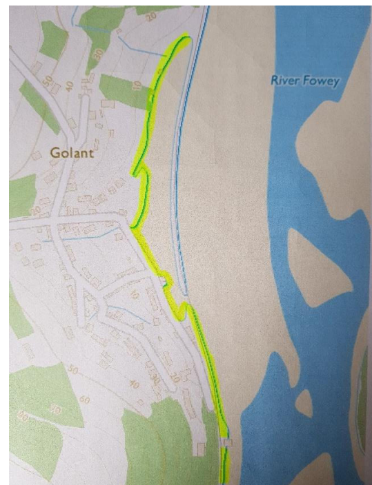
Fig 3: The Water's Edge