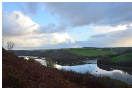
Area of Outstanding Natural Beauty and Marine Conservation Zone