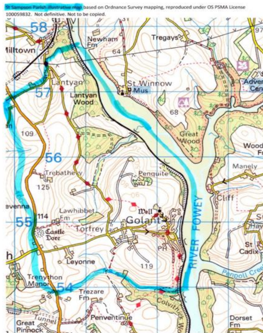
Fig 1 St Sampson Parish Neighbourhood Area

1.2. St Sampson Parish Council applied to Cornwall Council to designate the Parish as a "Neighbourhood Area." Cornwall Council formally designated the Neighbourhood Area on 13 th April 2015 in accordance with the Neighbourhood Planning (General) Regulations 2012. A map of the Neighbourhood Area (St Sampson Parish) is shown in Fig 1.