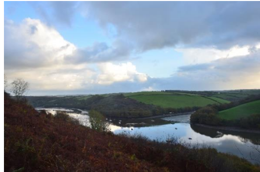
Area of Outstanding Natural Beauty and Marine Conservation Zone