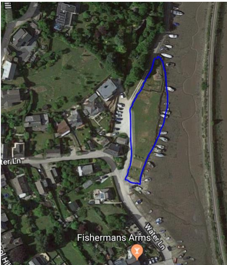
Fig 2: The Village Green and Play Area in Golant