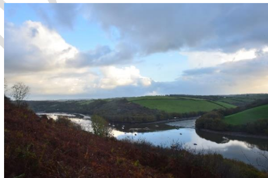
Area of Outstanding Natural Beauty and Marine Conservation Zone